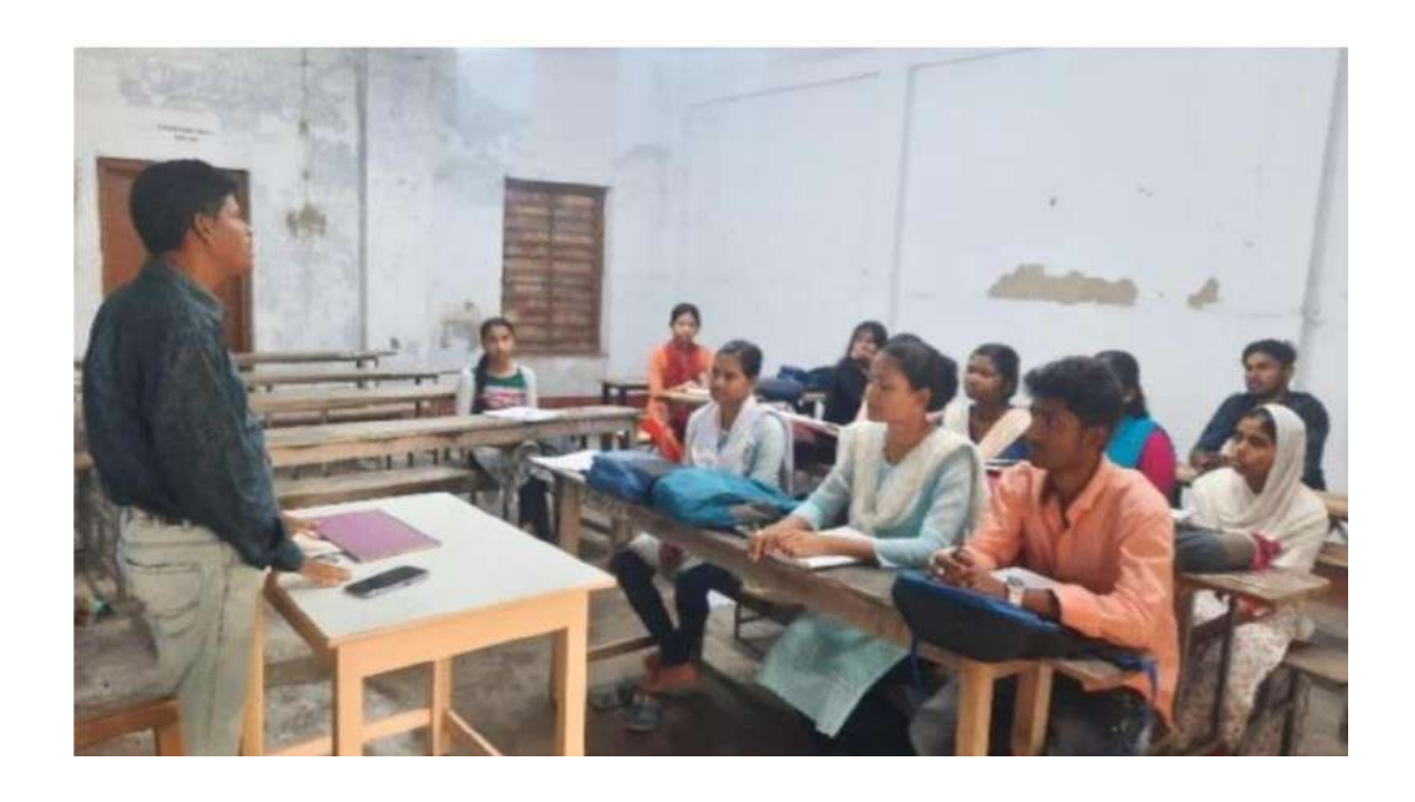
Lecture session in Add on course