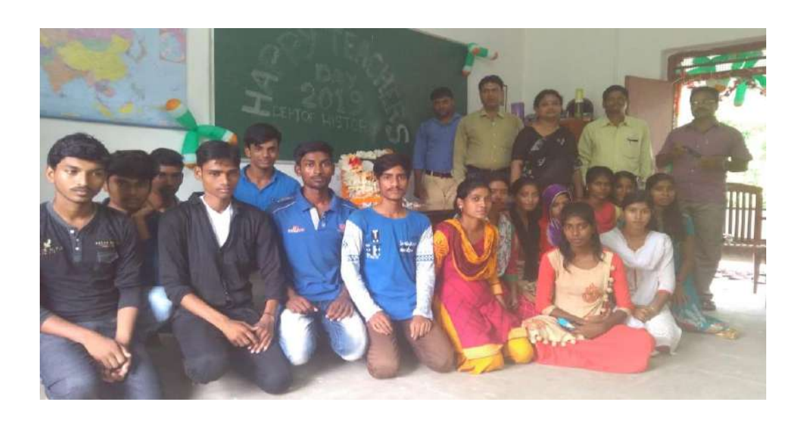
Students and Teachers