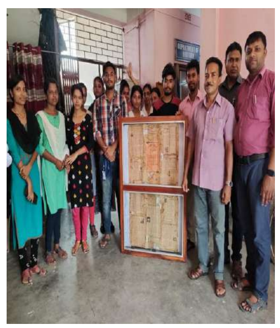
Wall Magazine Students and Teachers

With a view to foster creativity, self-expression and to develop writing, editing and designing skills of teachers and students History Department of Sitananda college has annually published a wall magazine entitled "Kaler Yatra" last few years. Like previous years, with the consent of college authority, that year also the department published their wall magazine " KALER YATRA " at 2.00 pm on 15<sup>th</sup> May 2023 at the presence of faculty members and students .